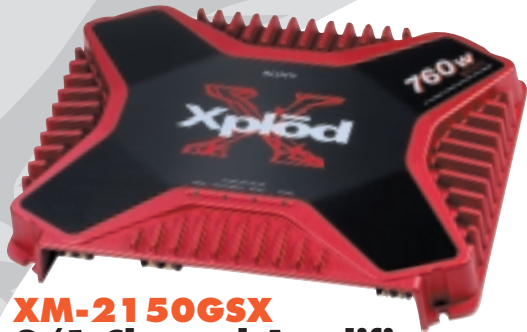
XM-2150GSX 2/1 Channel Amplifier